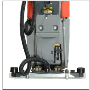
Professional self levelling Squeegee Ensuring Excellent performance