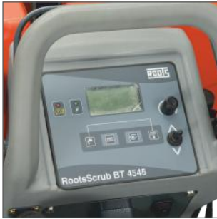
Ergonomic handle for operators of any height. Excellent view of the area to be cleaned. Soft touch buttons for selection of operation. LCD panel with display of hour meter, battery level.