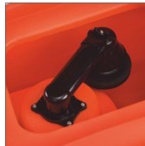
Easy tank cleaning, thanks to the large tank opening. Tank can be emptied quickly and easily via the large outlet hose. Overflow protection for the dirty water tank.