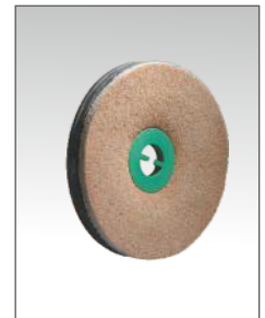
Pad holder available as option