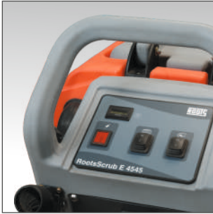
Ergonomic handle for operators of any height. Excellent view of the area to be cleaned.