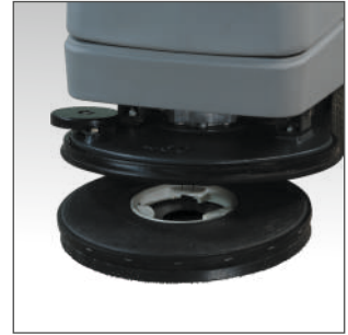
Brushes can be changed quickly without the need for any tools at the push of a button.