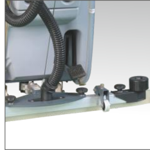
The straight, floating squeegee makes working close to edges possible and ensures that no water streaks remain even when negotiating corners.