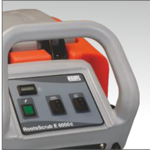
Ergonomic handle for operators of any height. Excellent view of the area to be cleaned.