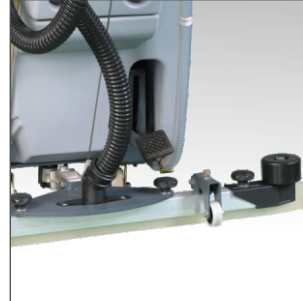
The straight, floating squeegee makes working close to edges possible and ensures that no water streaks remain even when negotiating corners.