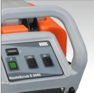
Ergonomic handle for operators of any height. Excellent view of the area to be cleaned.