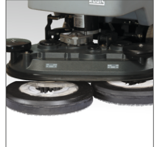
Brushes can be changed quickly without the need for any tools.