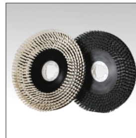
Variety of brushes to suit different applications.