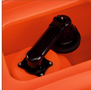
Easy tank cleaning, thanks to the large tank opening. Tank can be emptied quickly and easily via the large outlet hose. Overflow protection for the dirty water tank.