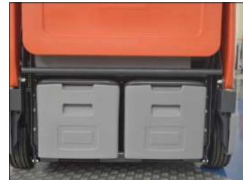
Easy to remove and dispose dual debris hoppers.