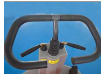
To facilitate effective and efficient cleaning operations, Brush controls are mounted on the steering column.