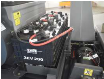
Four heavy duty deep cycle batteries provide extended run time and increased productivity.

RELIABILITY: Rugged, High quality build, robust construction and essential mechanics ensure reliability.