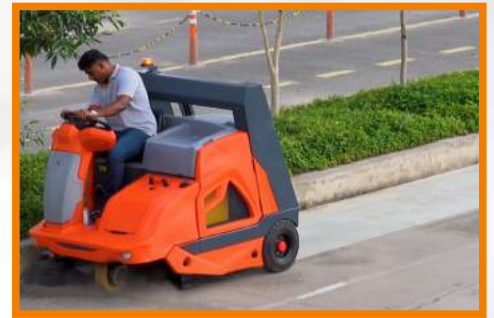
Excellent Sweeping, removes accumulated soil with ease