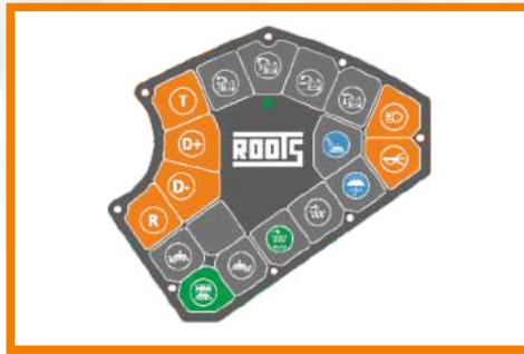
Ergonomically designed control panel view with one Soft Touch