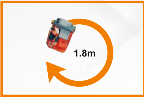
Maximum low turning radius 1800 mm