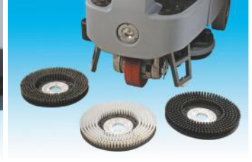
Variety of brush options available to suit different floors.