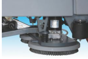
Brush release by foot. No tools required.