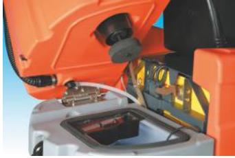
Dirt water tank can be easily cleaned - thanks for the easy accessibility and large opening.

Battery Operated Ride On Scrubber Drier • Choice of high traction batteries • Running Hours from 3 to more than 5 hours • Soft touch control panel • Provision for holding bottles, log book, manuals etc., as standard, close to the operator • Large Tanks for un-interrupted cleaning performance • Change of brushes and squeegee lips needs no tools • Break away Squeegee • In built fault diagnosis system • Reverse alarm • Head Lamp • Large Anti Skid Wheels.