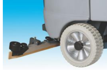
Large Anti Skid wheel for safe driving and operation on any floor.