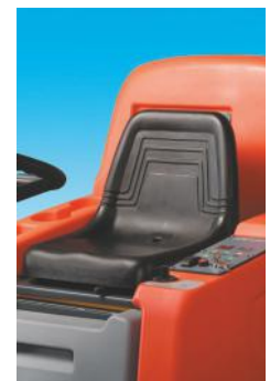
Ergonomically designed driver seat for comfort, easy access to all controls and good all round visibility.