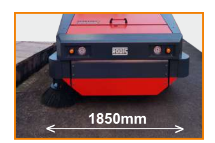
Best in class sweeping width. Theoretical area performance up to 29,600 m<sup>2</sup>/hr.