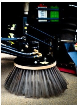
Large side broom with flexible head