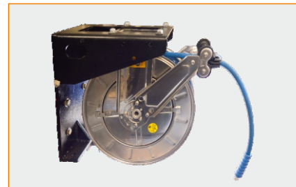
Additional High Pressure Jet Cleaner