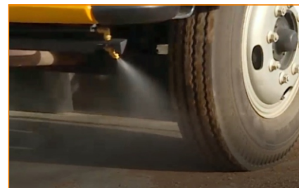
Front Spray Bar

Roots reserves the right to make any changes considered necessary for the purposes of improvement at any time or for any reason without prior notice, in line with its policy of continuous product development and progress.