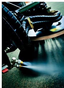
Water Jet for Dust Suppression